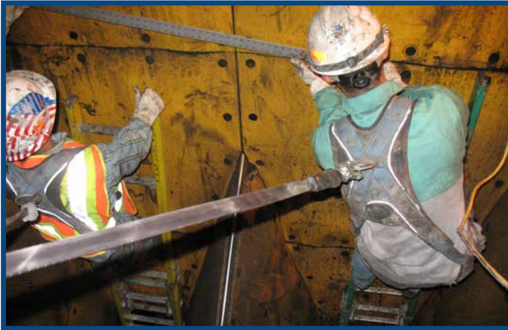
Urethane Chute Liners