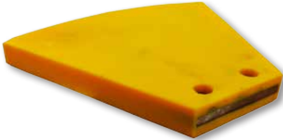
Urethane Coated Mixer Paddle