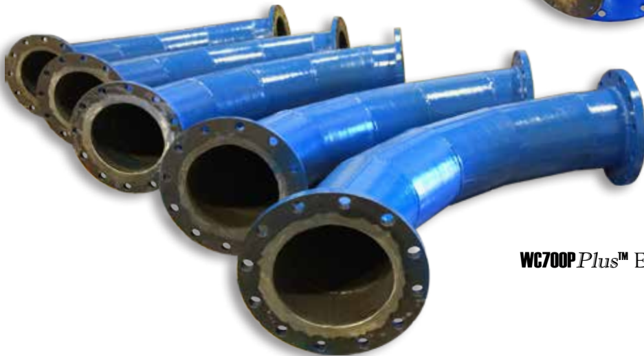
WC700P Plus™ Elbows

(See reverse for WC700P Plus™ Pipe information.)