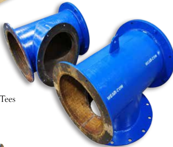
WC700P Plus™ Tees