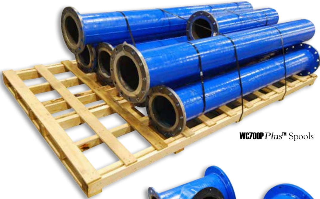
WC700P Plus™ Spools