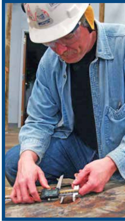
Design Improvements, Retrofits, Tolerance Control