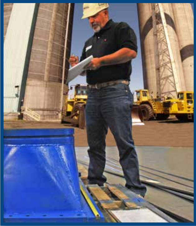
Wear & Cost Analysis, Scope of Project Evaluation, Accurate Field Measurements at Plant Sites