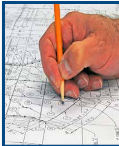
Quality Assurance Checks, Installation Support

(See reverse for Engineering Services information.)