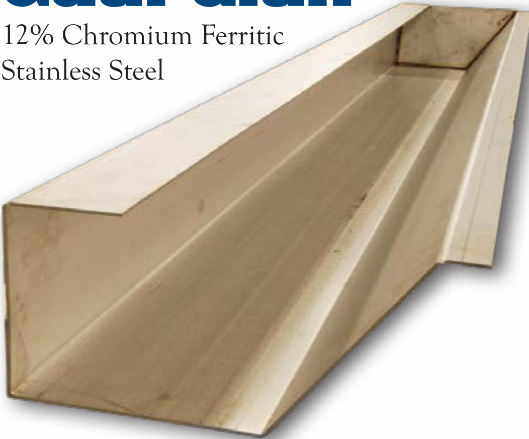
Guardian™ Chromium Stainless Gutters