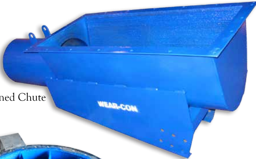
FeatherClad™ Lined Chute