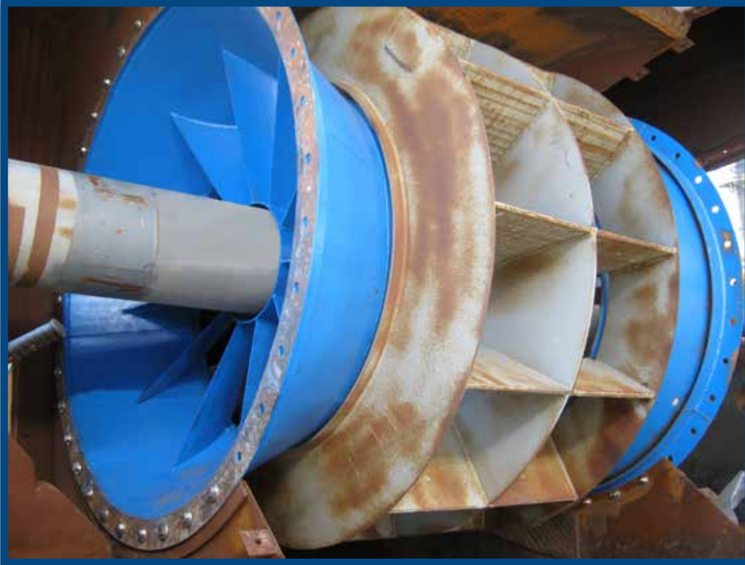
I.D. Fan Intake Housings made of WC500™ Wear Plate.