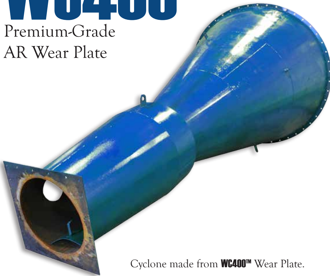
Cyclone made from WC400™ Wear Plate.