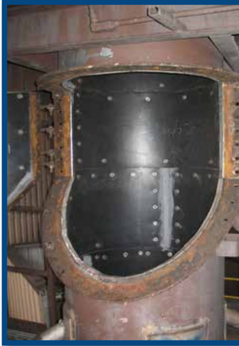
PGP190™ Black UHMW lined Pug Mill Mixer & Chute.