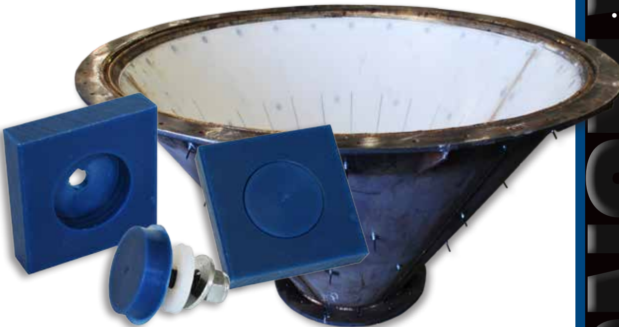
UHMW capped plow bolt & counter-bored UHMW.

One of many different bolts available to install UHMW.