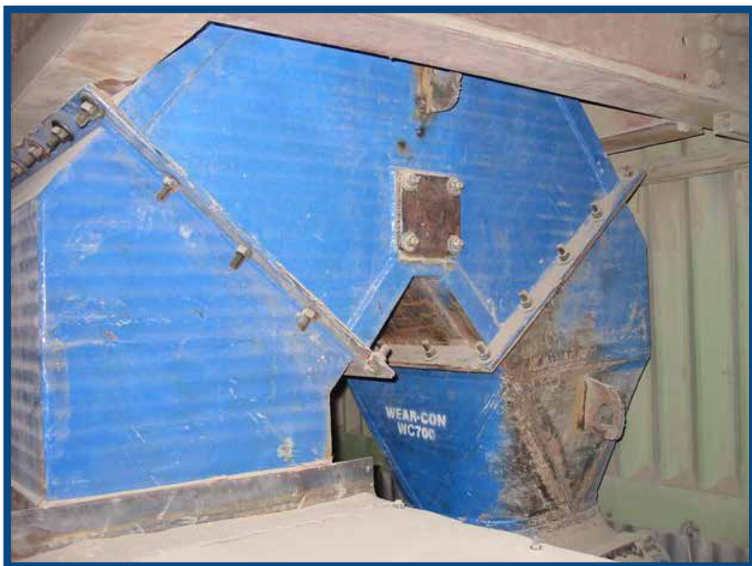
Tripper Chute & Hopper made from WC700 Plus™ Wear Plate.