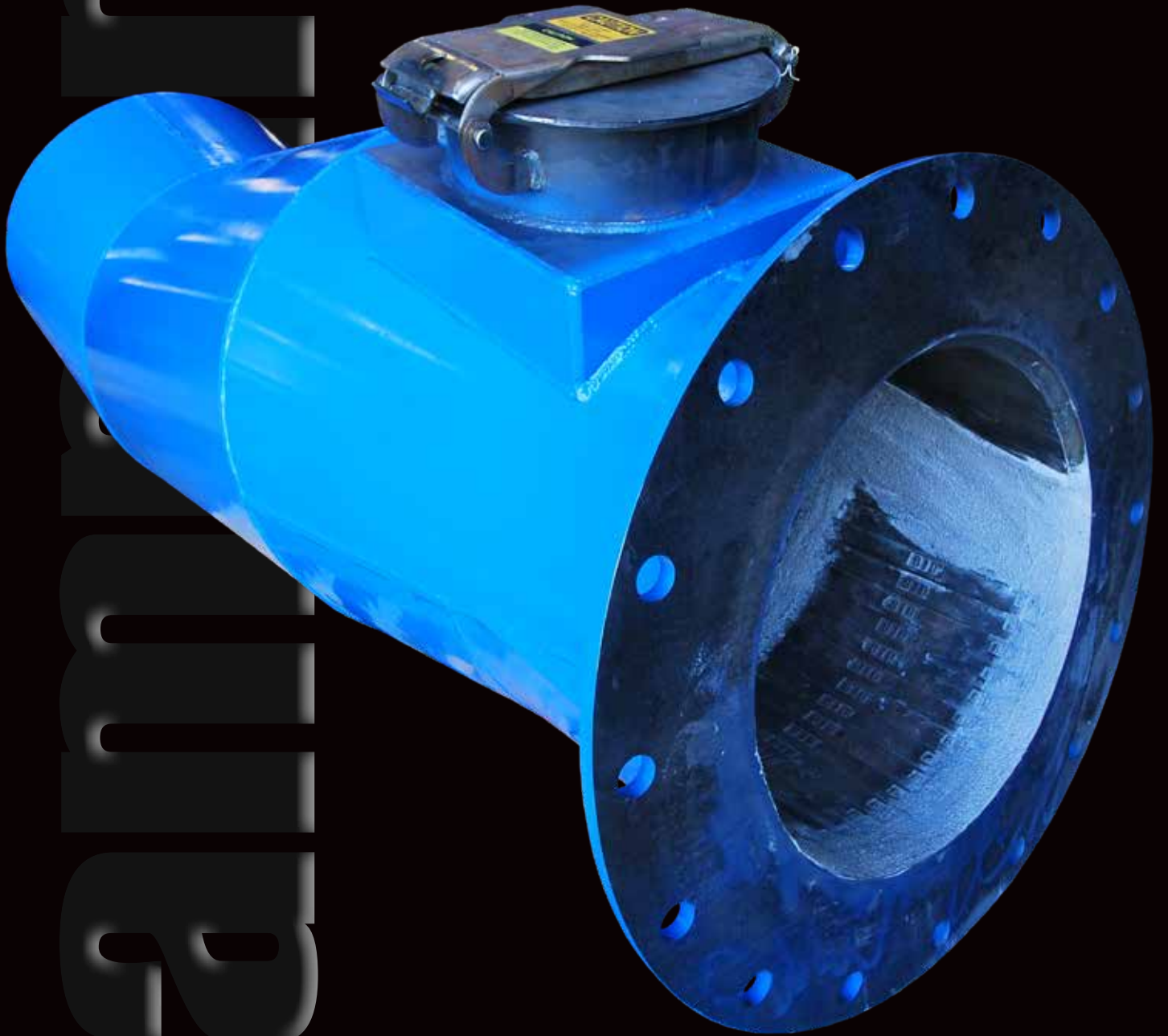
Ball Mill Charger lined with WC810™ Rampart™ Bars.