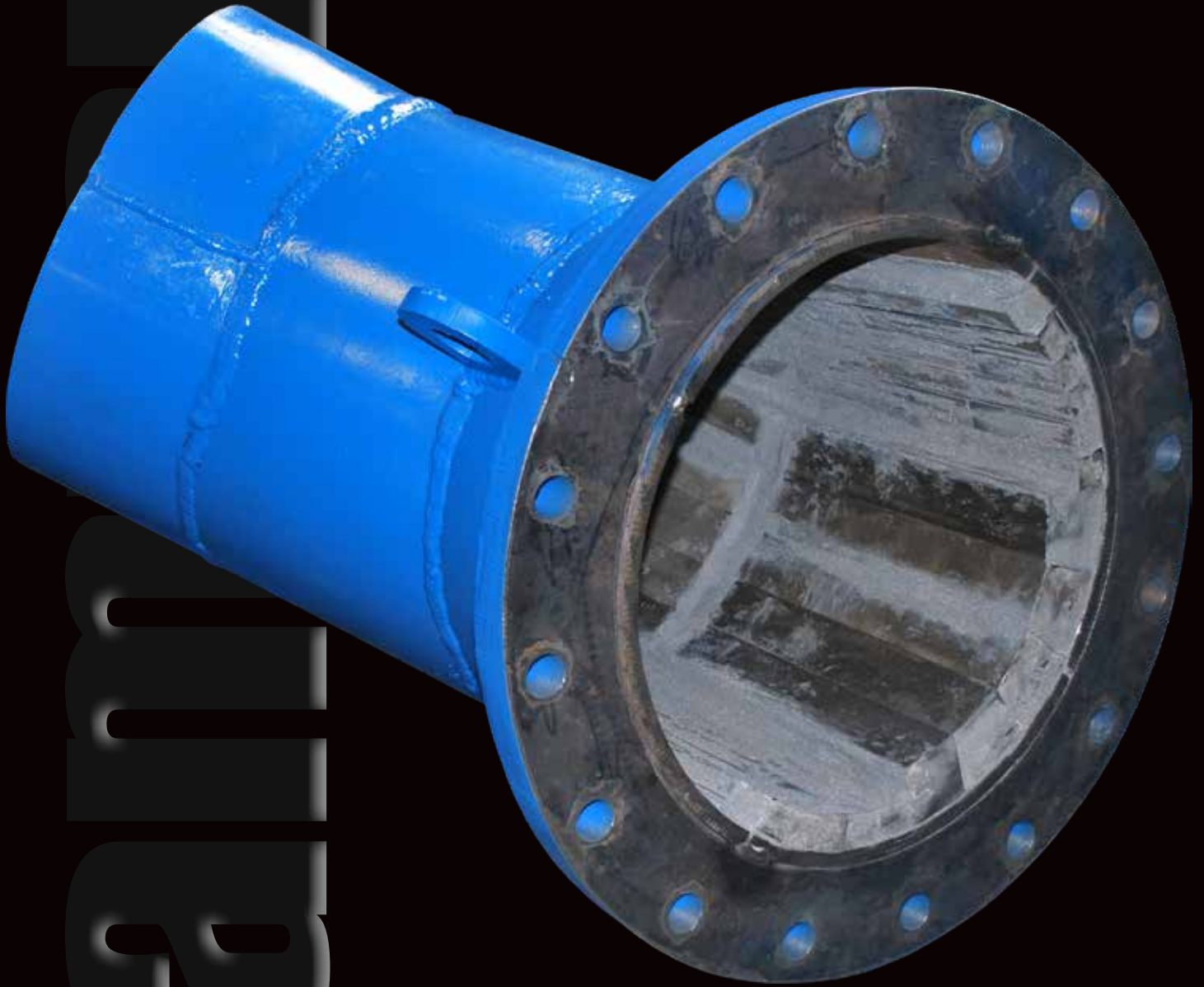
WC880™ Rampart™ Bar lined Elbow.