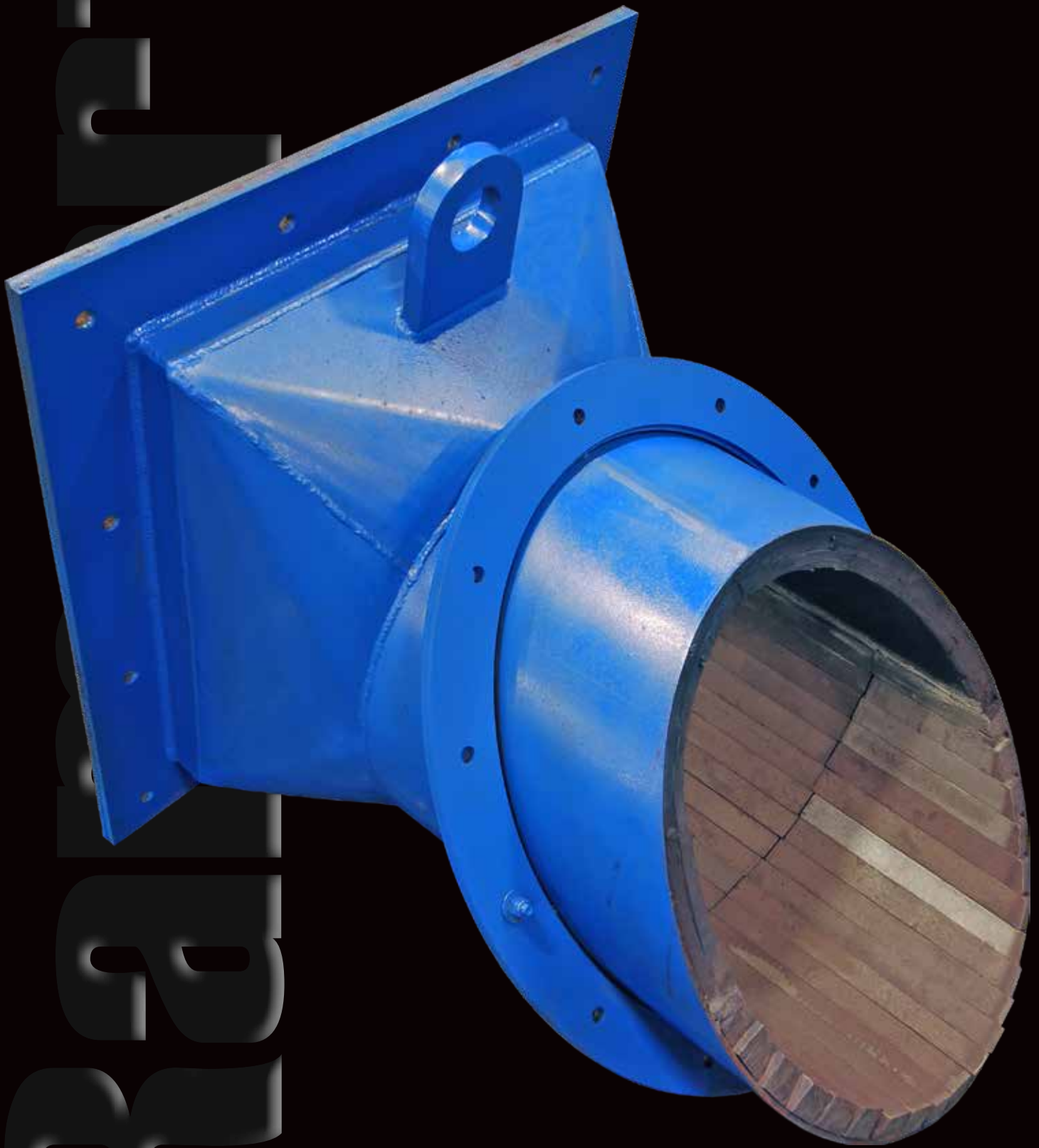
Square to Round Transition lined with WC810™ Rampart™ Bars & RubberLined™ Flange.