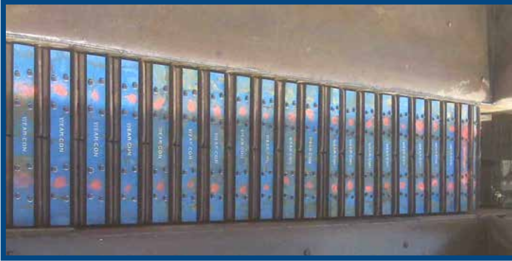
WC400™ WearStrips installed in Apron Feeder at a Sugar Mill.

Made of either INERTIA™ , WC400™ , WC500™ , Diamond-Clad™ , WC700Plus™ & HyperClad Wear Plate.