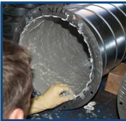
Installing WC90™ HexTile

(See reverse for WC90™ Ceramic HexTile Information.)