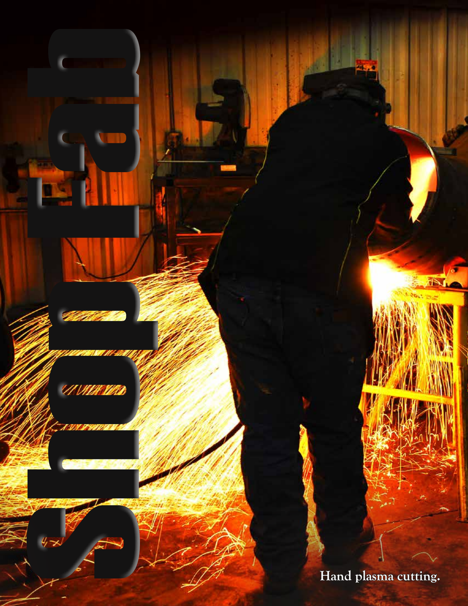
Hand plasma cutting.