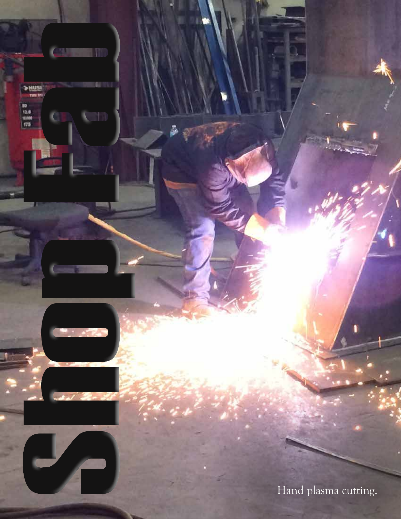
Hand plasma cutting.