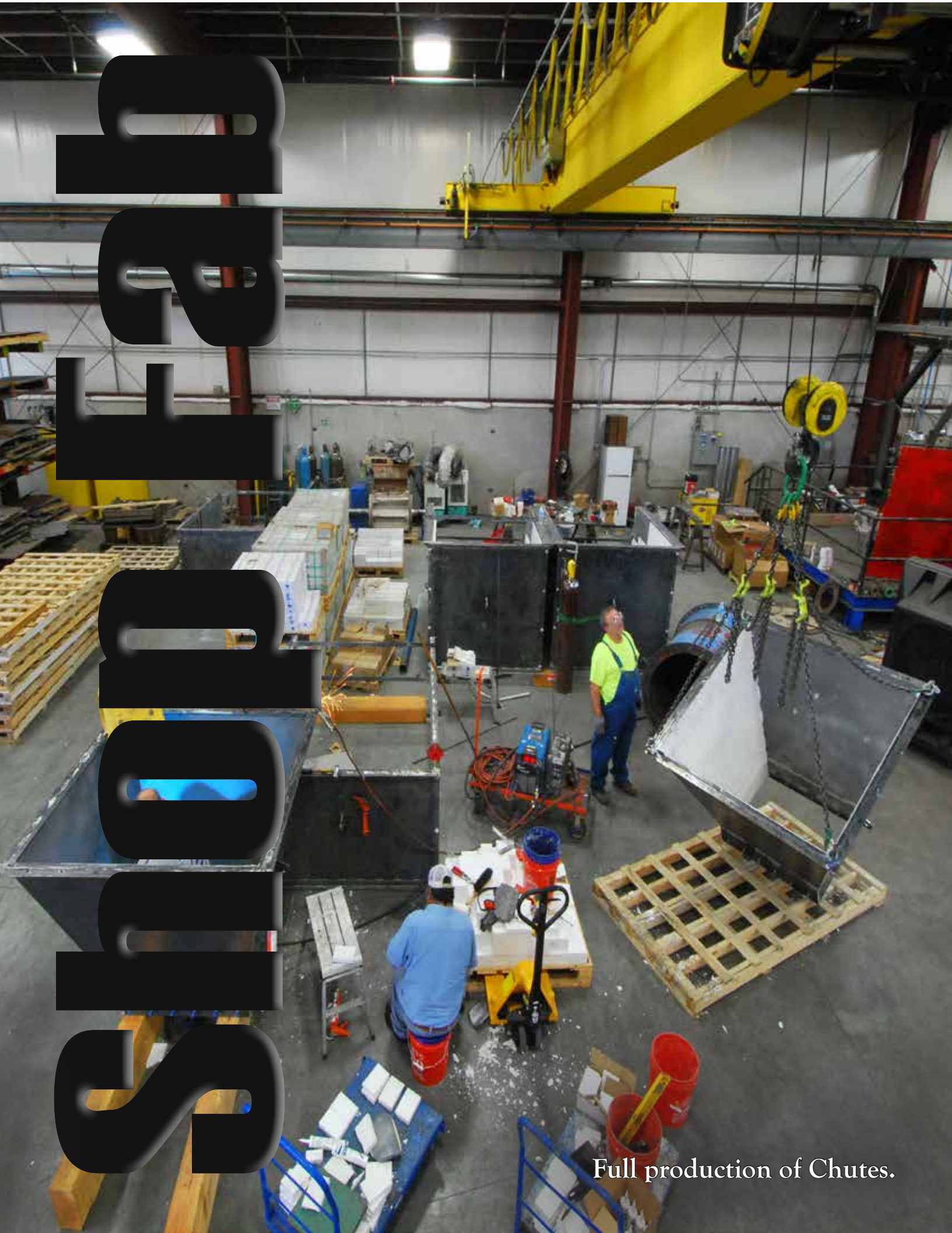
Full production of Chutes.