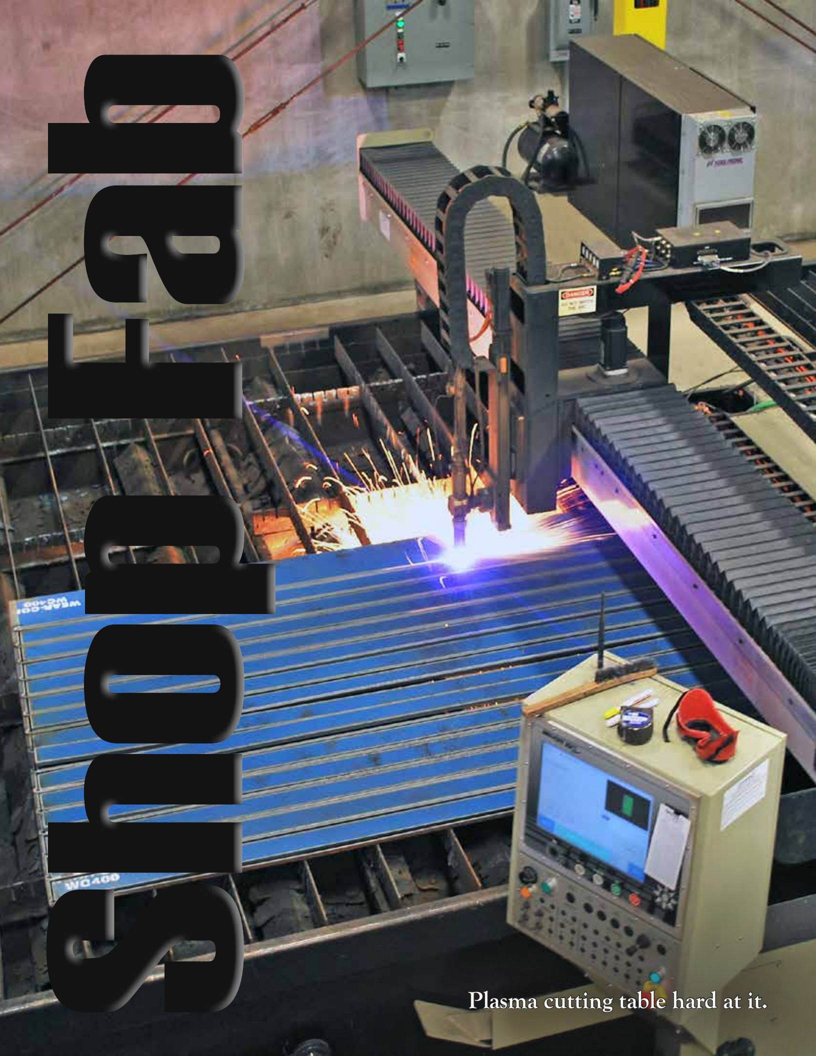
Plasma cutting table hard at it.