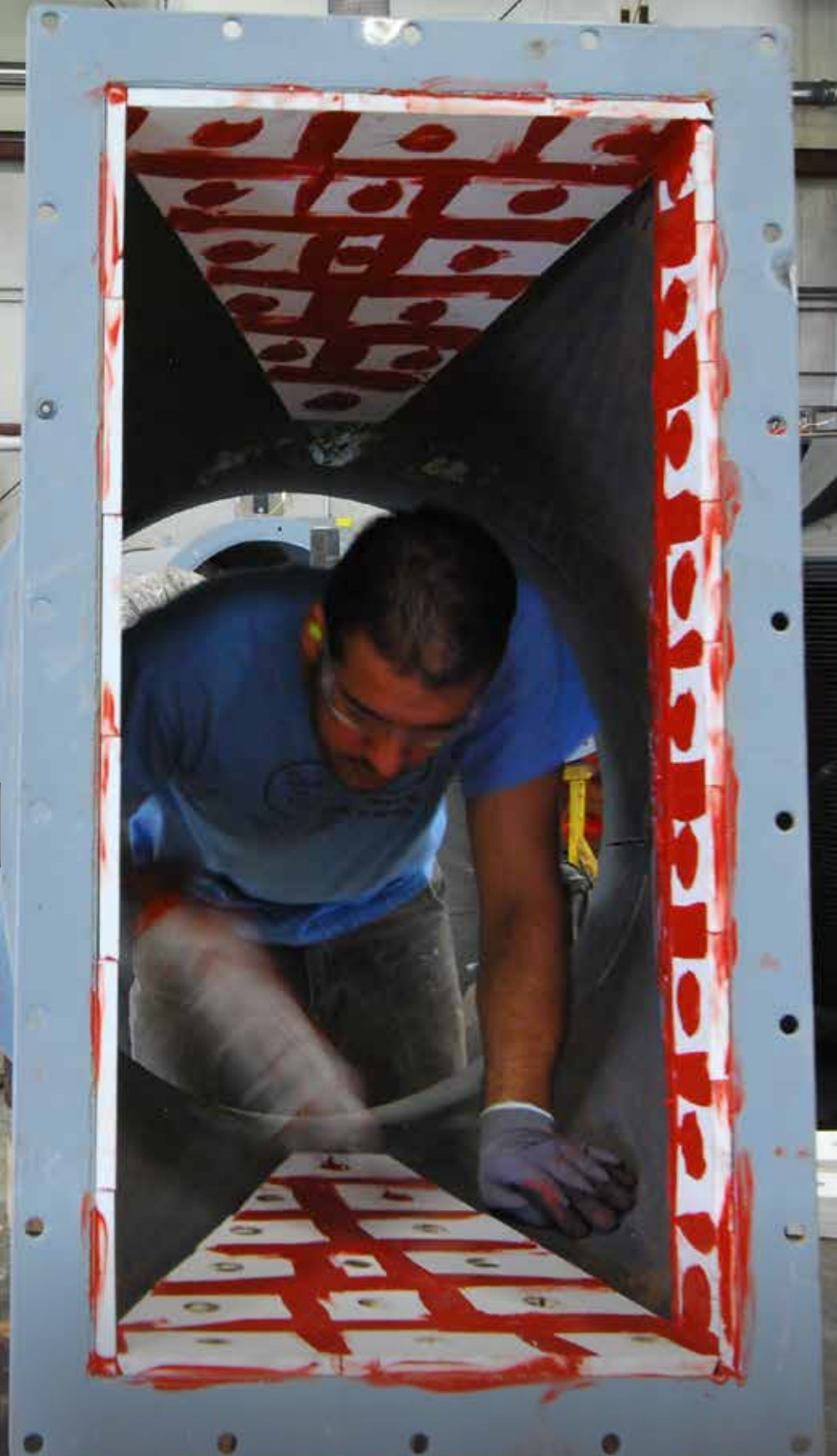
WC90™ Weldable Ceramic Tile being installed in a Square to Round Transition.