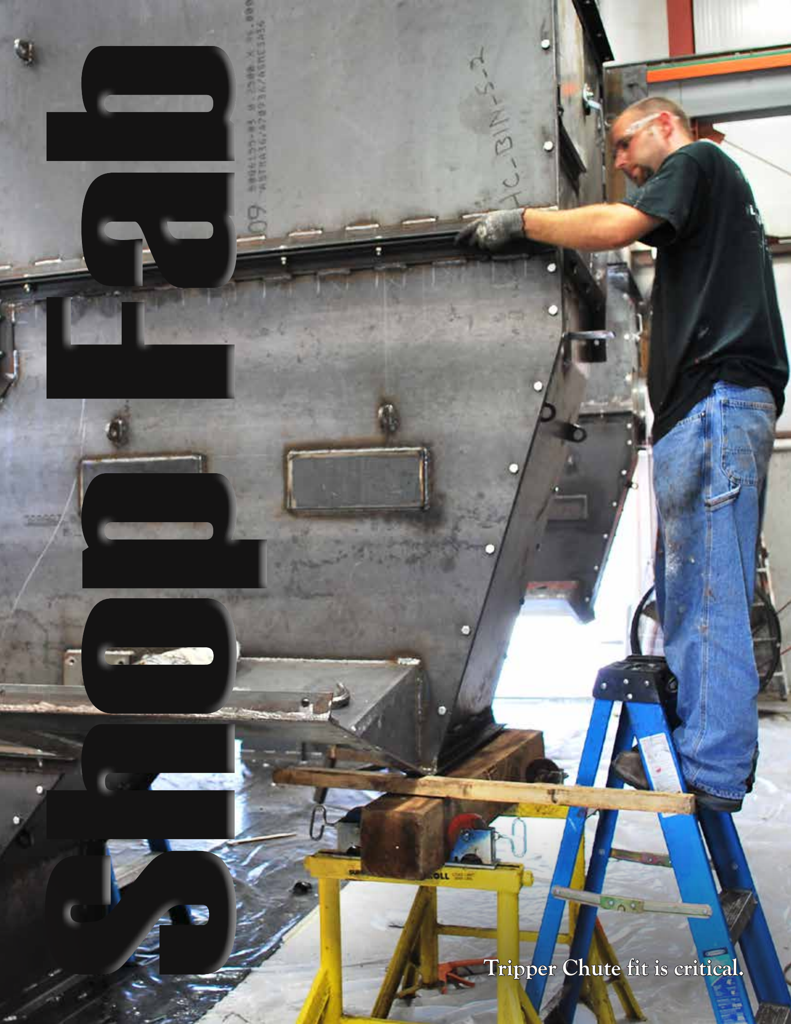
Tripper Chute fit is critical.