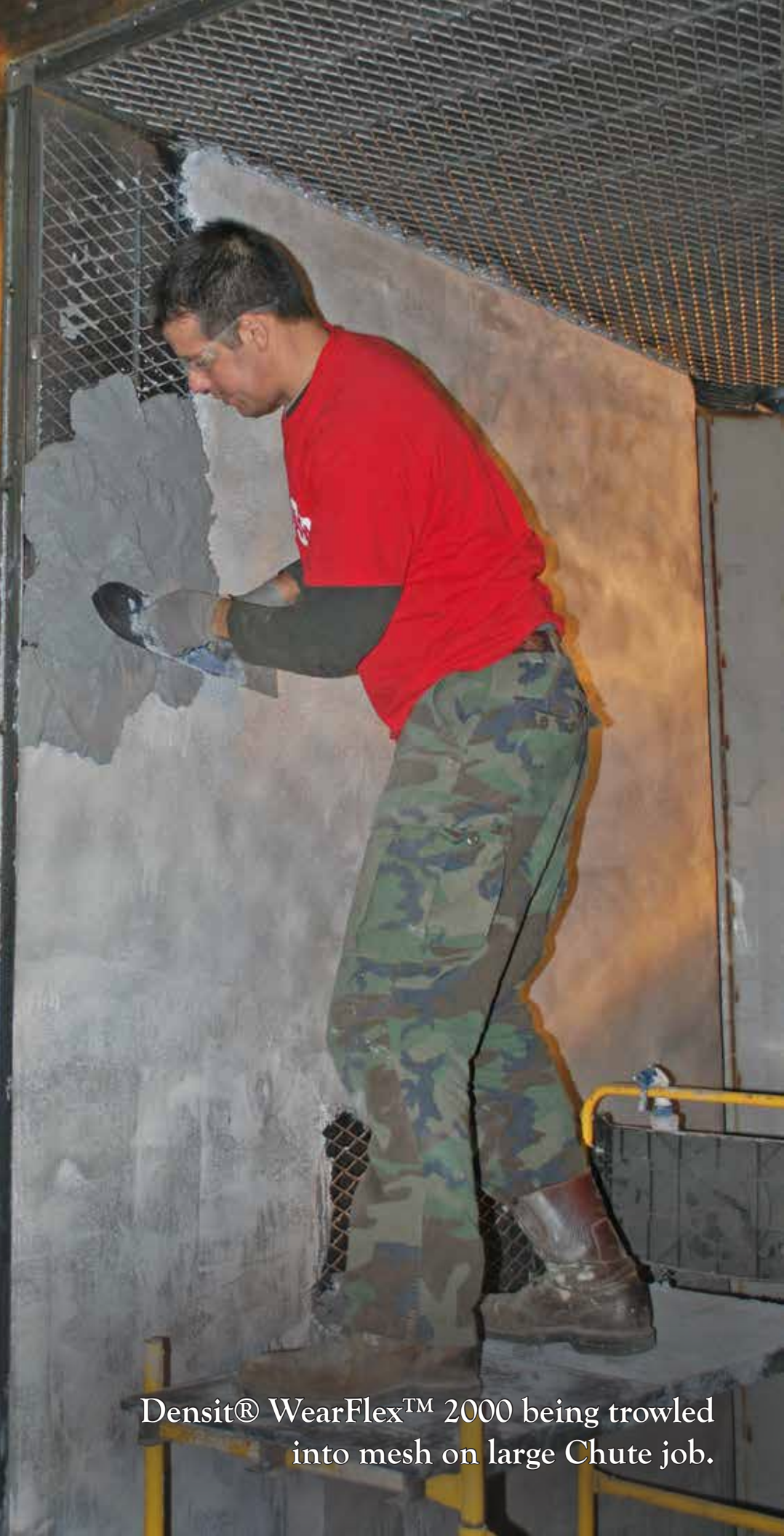
Densit® WearFlex™ 2000 being trowled into mesh on large Chute job.