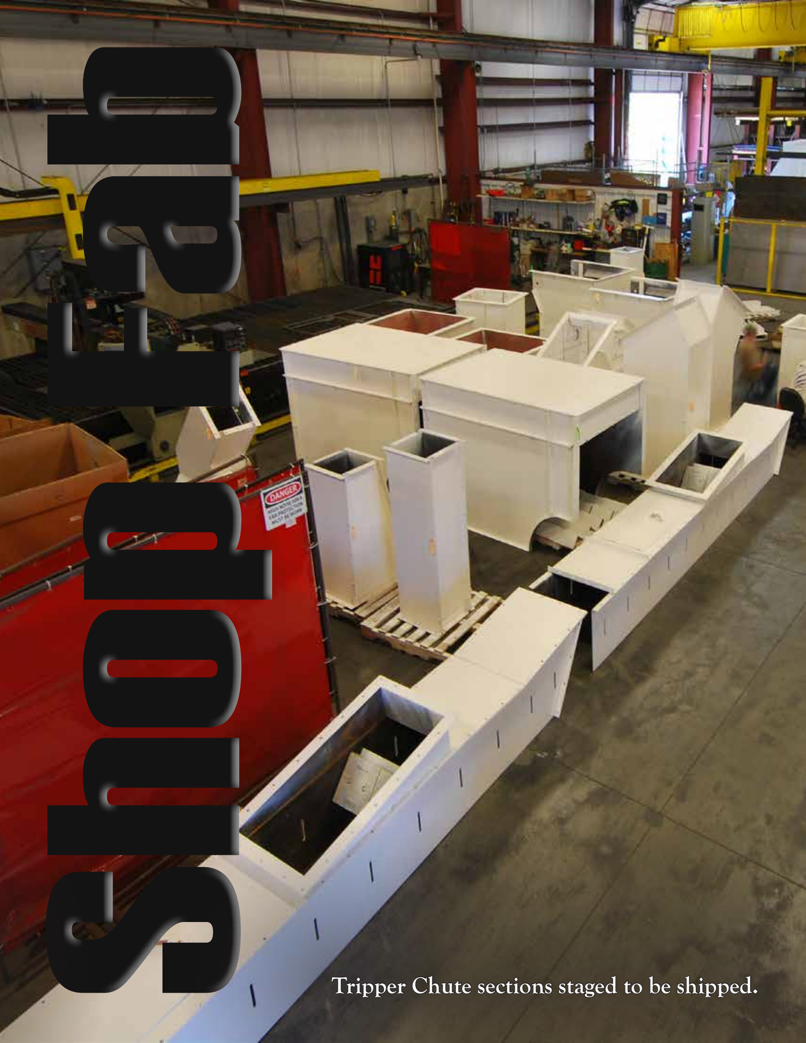
Tripper Chute sections staged to be shipped.