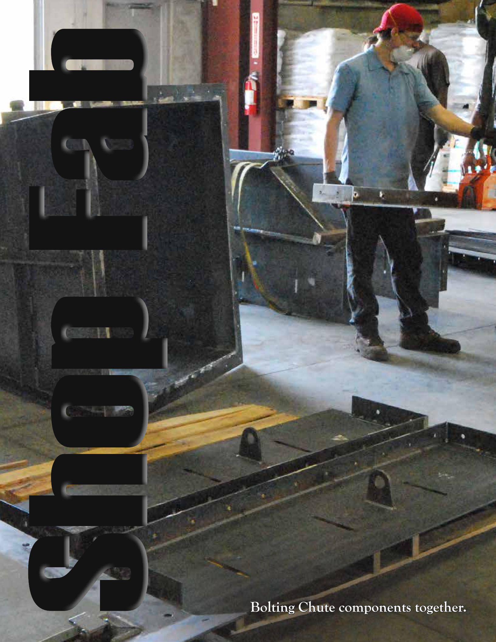
Bolting Chute components together.