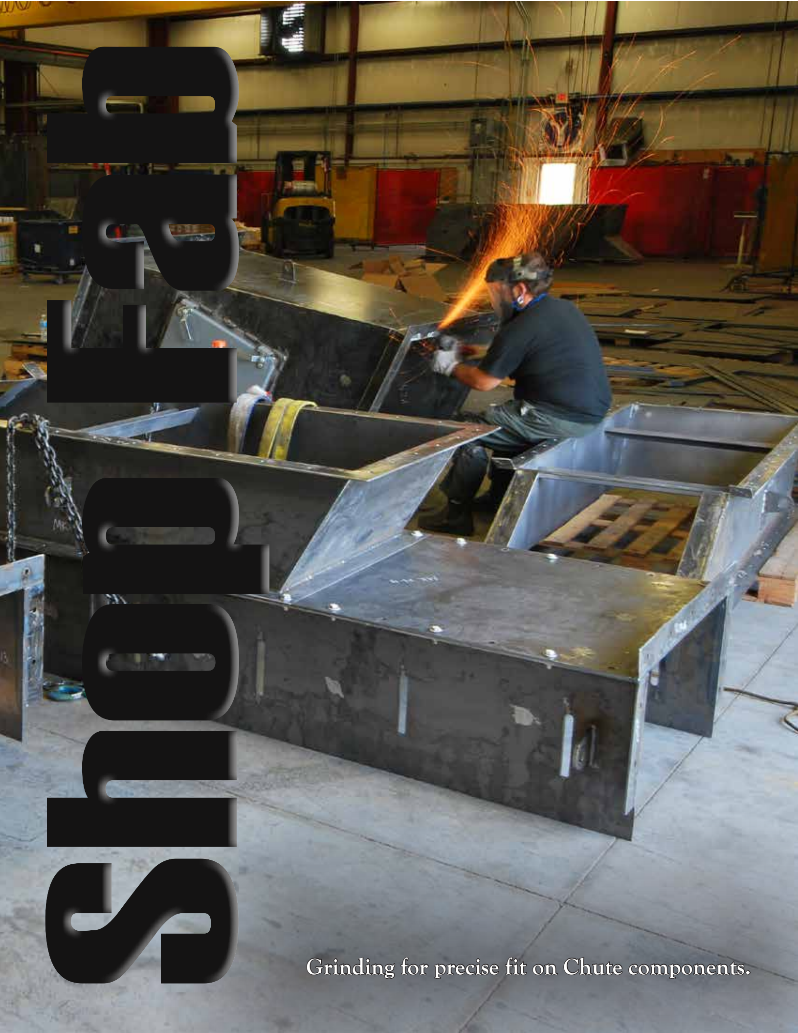
Grinding for precise fit on Chute components.