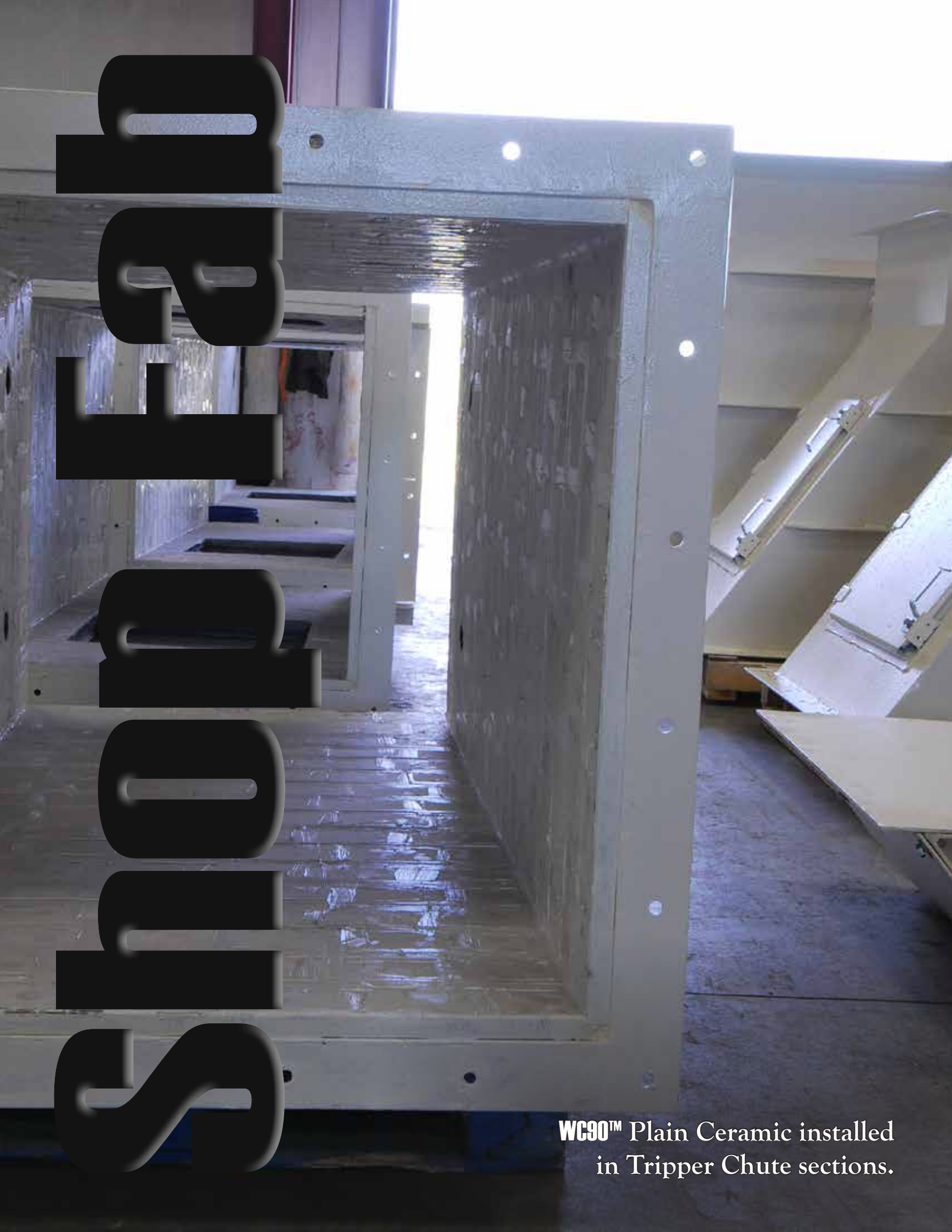
WC90™ Plain Ceramic installed in Tripper Chute sections.