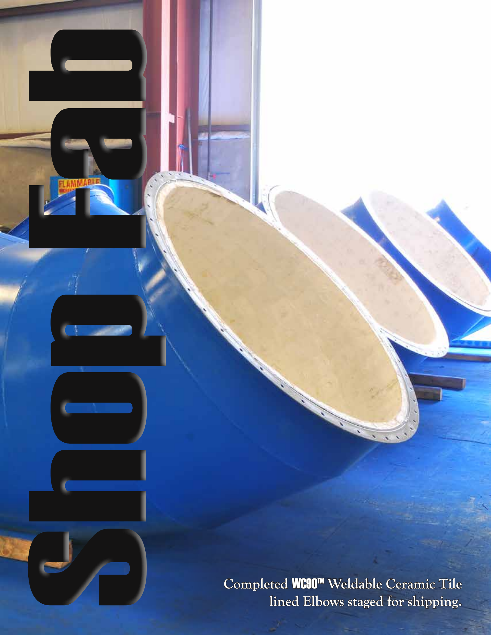
Completed WC90™ Weldable Ceramic Tile lined Elbows staged for shipping.