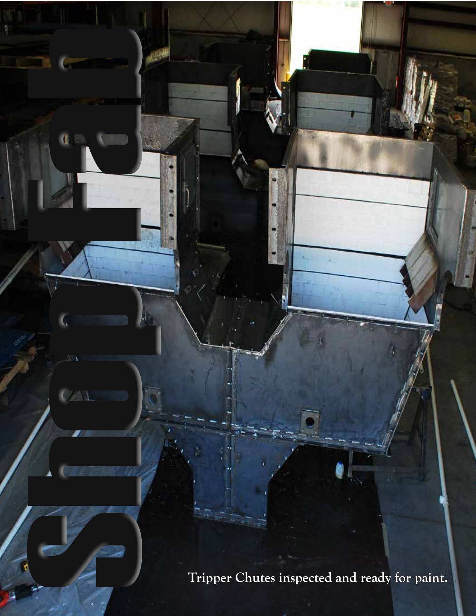
Tripper Chutes inspected and ready for paint.