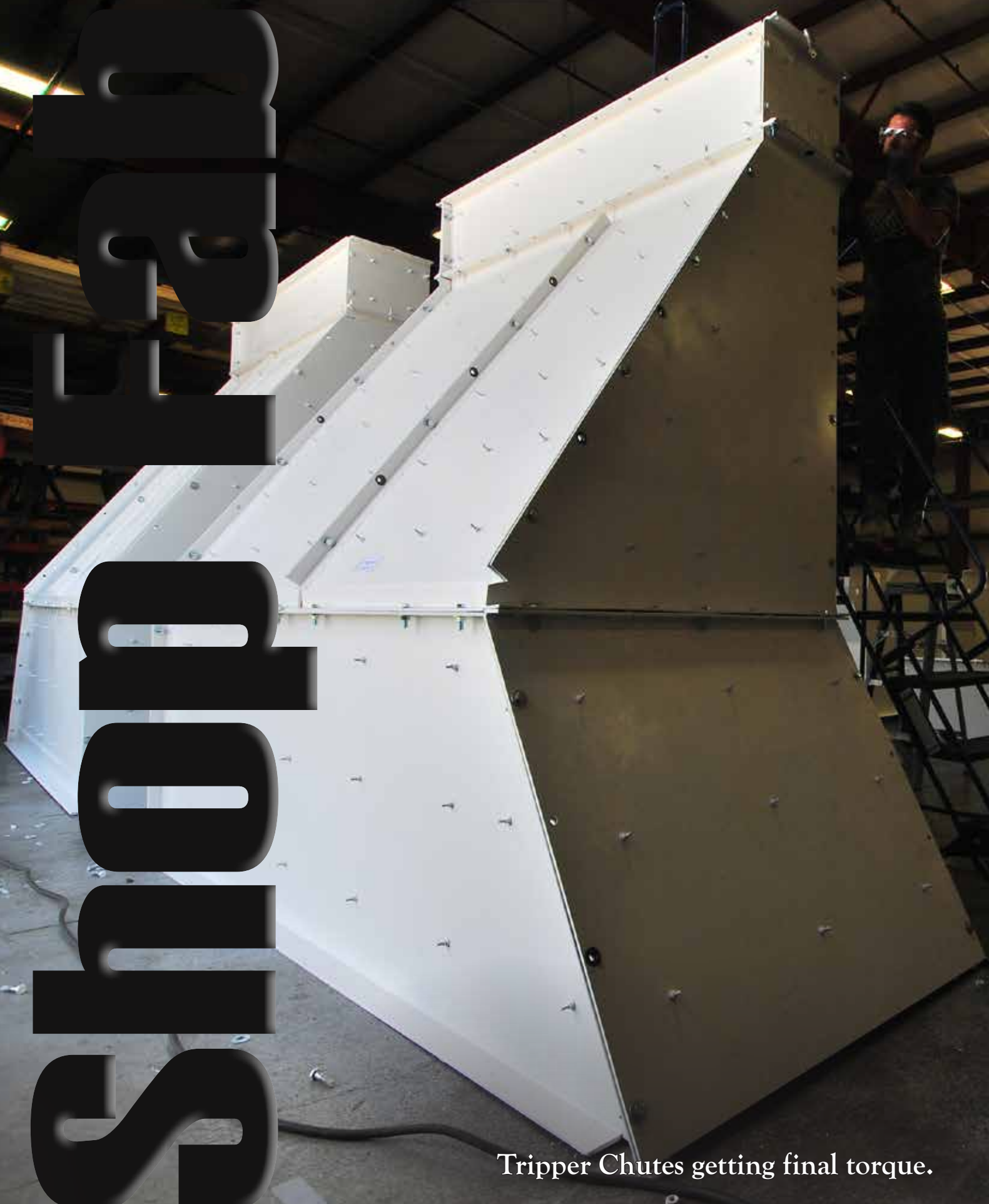
Tripper Chutes getting final torque.