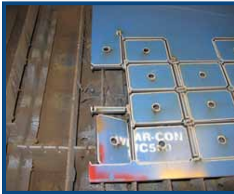
WearPads cut out of WC500 Plate.

(See reverse for Plasma Cutting Services Information.)