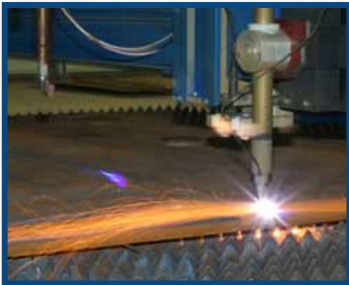
Intricate cuts for fabrication performed.