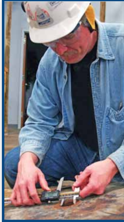
Design Improvements, Retrofits, Tolerance Control