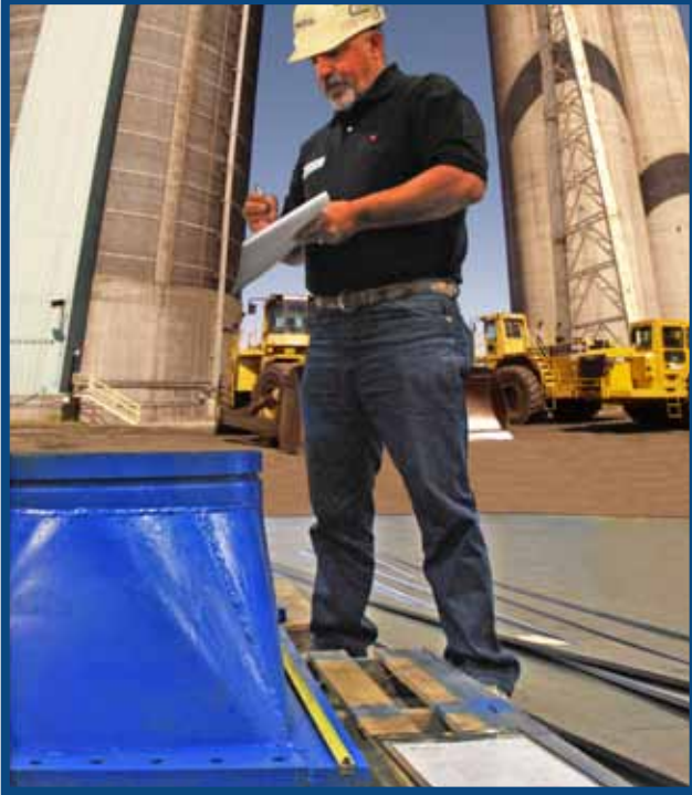
Wear & Cost Analysis, Scope of Project Evaluation, Accurate Field Measurements at Plant Sites